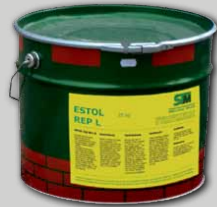
ESTOL-Repair Mortar L